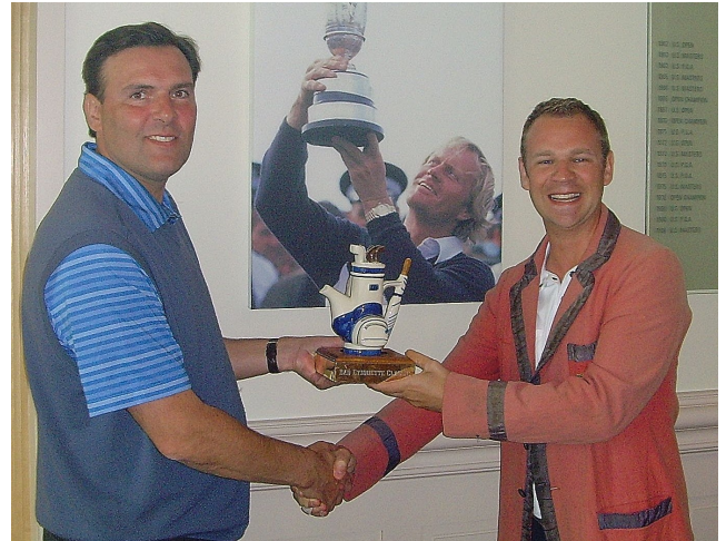
Jack Nicklaus joins the presentation party but gets distracted recalling how in 1978 he had his name engraved on the trophy in a larger font than rival Tom Watson the year before.